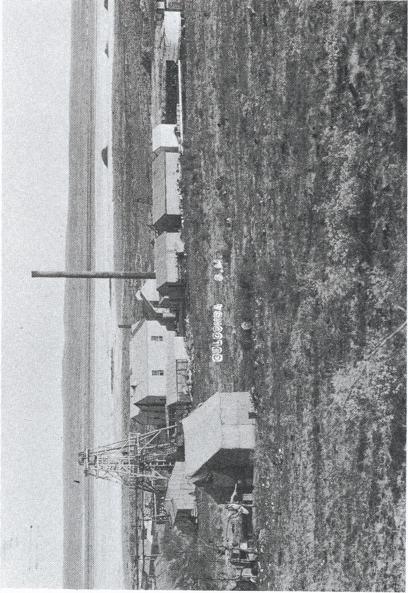
Golconda Gold Mine, Lake Austin.