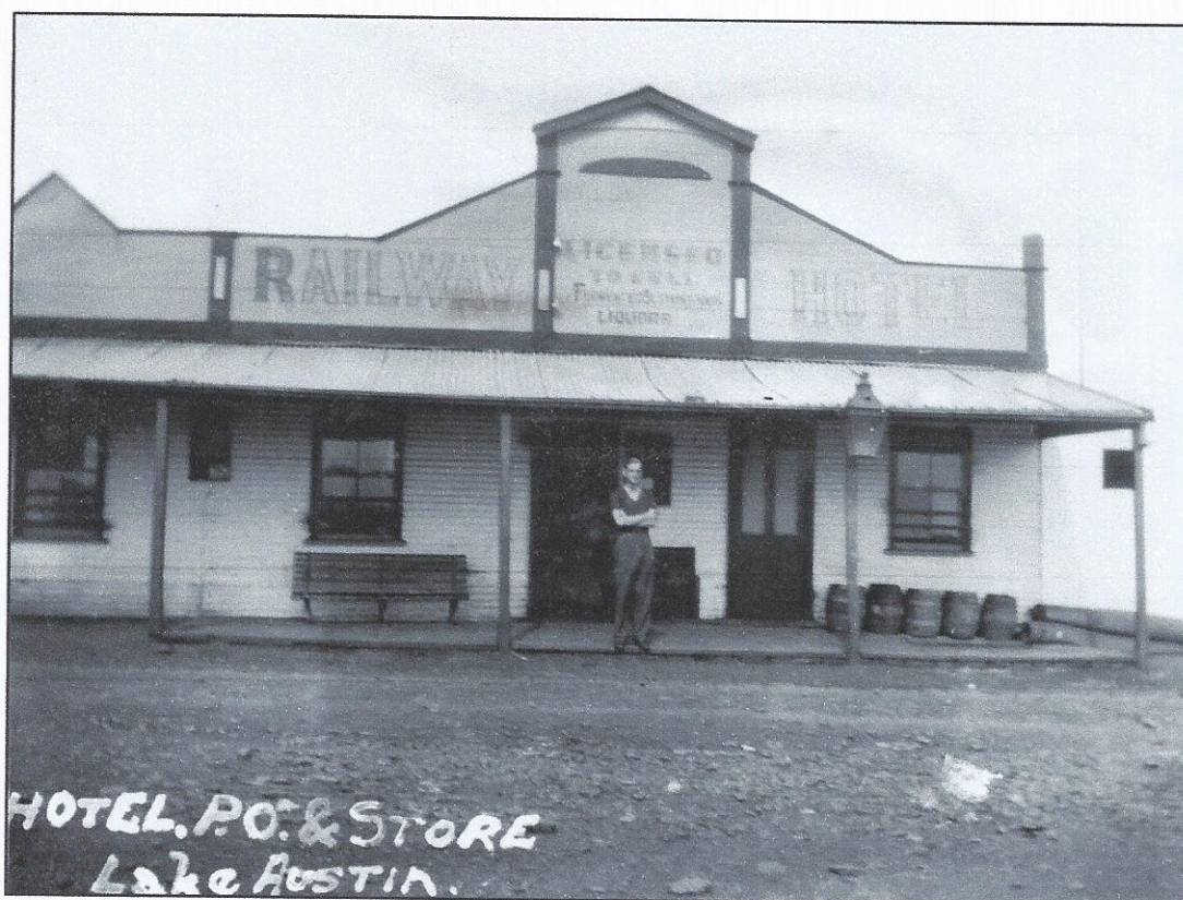
Figure 22 - Hotel, Post Office & Store Lake Austin c.1900

When May Vivienne passes through The Island (Austin) c.1899, she states that: